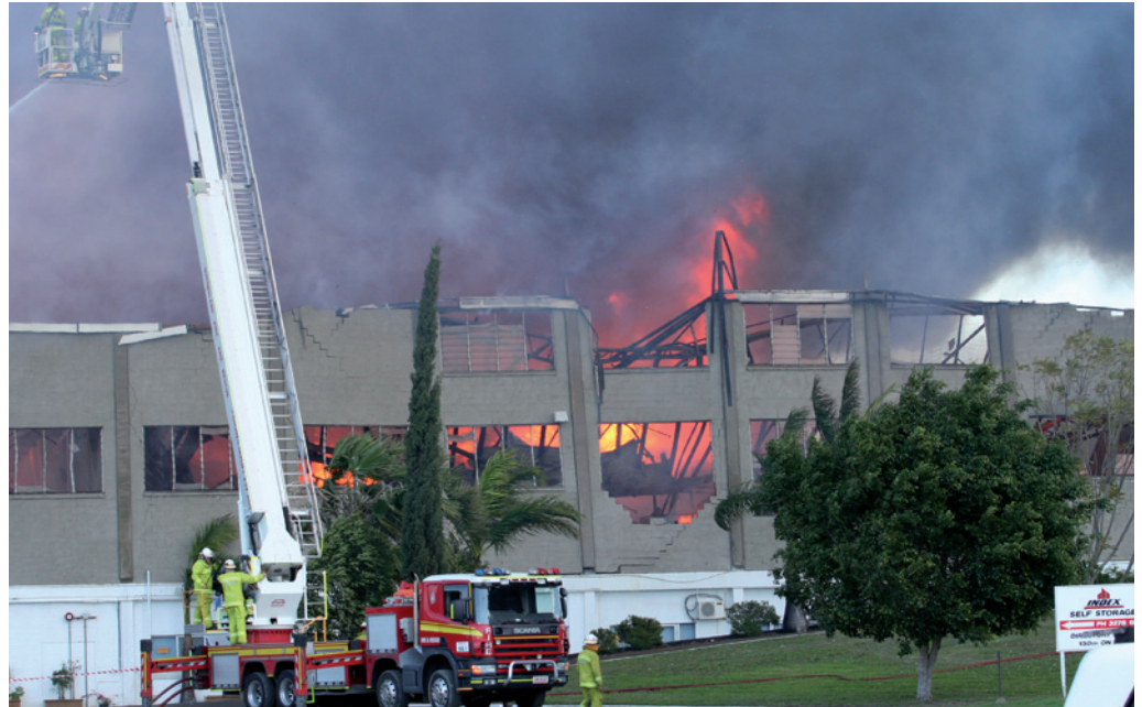
THE PRESSURE IS ON TO REDUCE AUSTRALIAN SPRINKLER STANDARDS